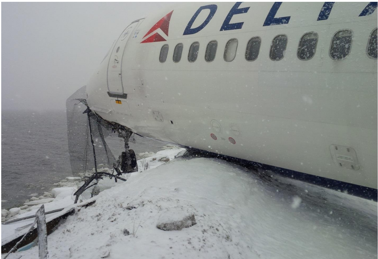
Figure 2. Ground marks and airplane location.

Note: The background image does not depict the environmental conditions on the day of the accident.