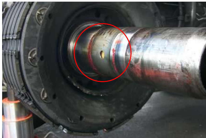
Figure 4: Hole that may allow excess grease to migrate to hot brake area

During the brake application on landing the temperature of the heat sink increased and heated the excessive grease and created smoke.