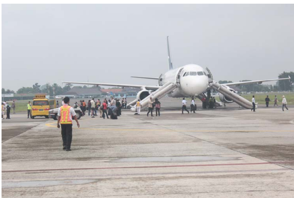
Figure 1: 9V-SBH evacuation between the taxiway bravo and apron

There was no damage on the aircraft and other property.