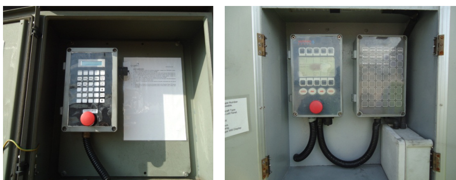
Figure 3: 30-key (L) and 54-key (R) operator panel