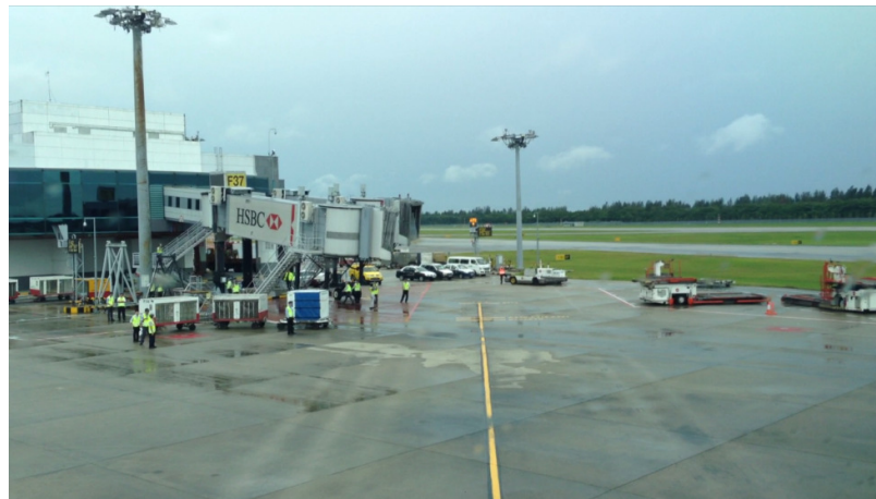
Figure 4: View of the cargo container and the BTs in the simulated docking