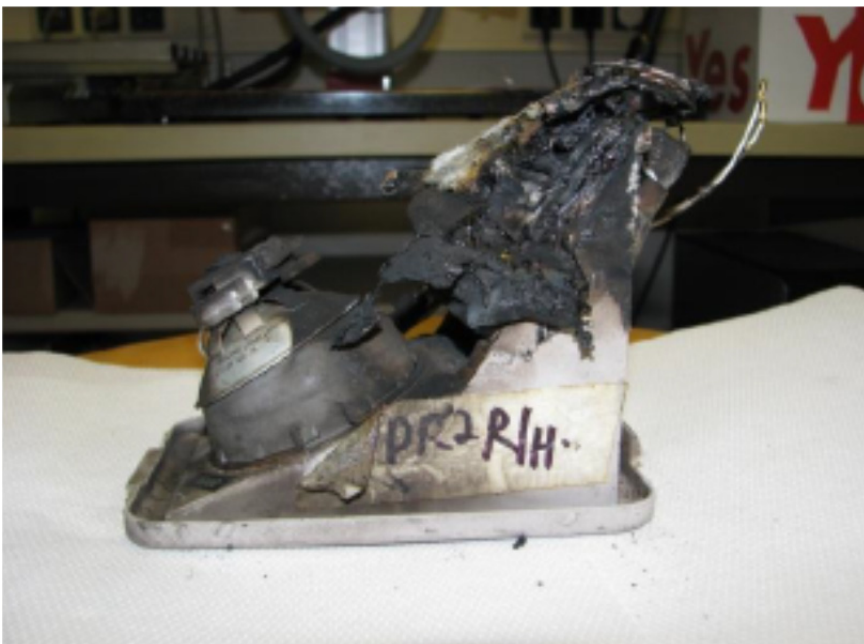
Lamp unit with fire and heat traces