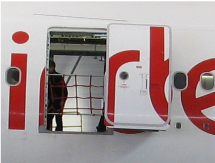
Open door R2

Door R2, in which the work light was installed, is opened almost always whenever the airplane is on the ground since it is used as a service door. The door is pushed outward when it is opened and all sides are exposed to the weather. The examination of an aircraft of the same type showed that the upper side of the door has openings through which water can flow unhindered into the door. Between the door structure and the inner lining there are no seals which would prevent the water from penetrating. When the door panel of this airplane was removed it was determined that the insulation mats had partially collected substantial amounts of water.