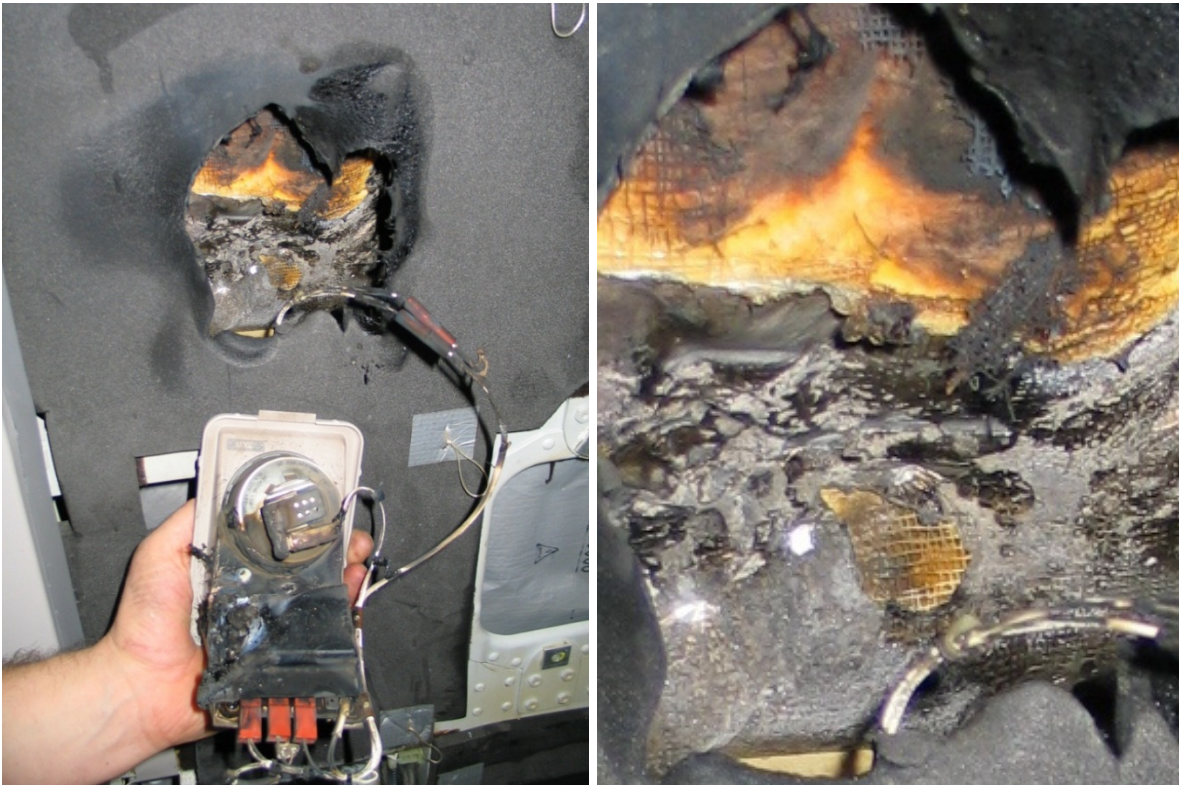
Traces behind the door panelling (overview and detail)