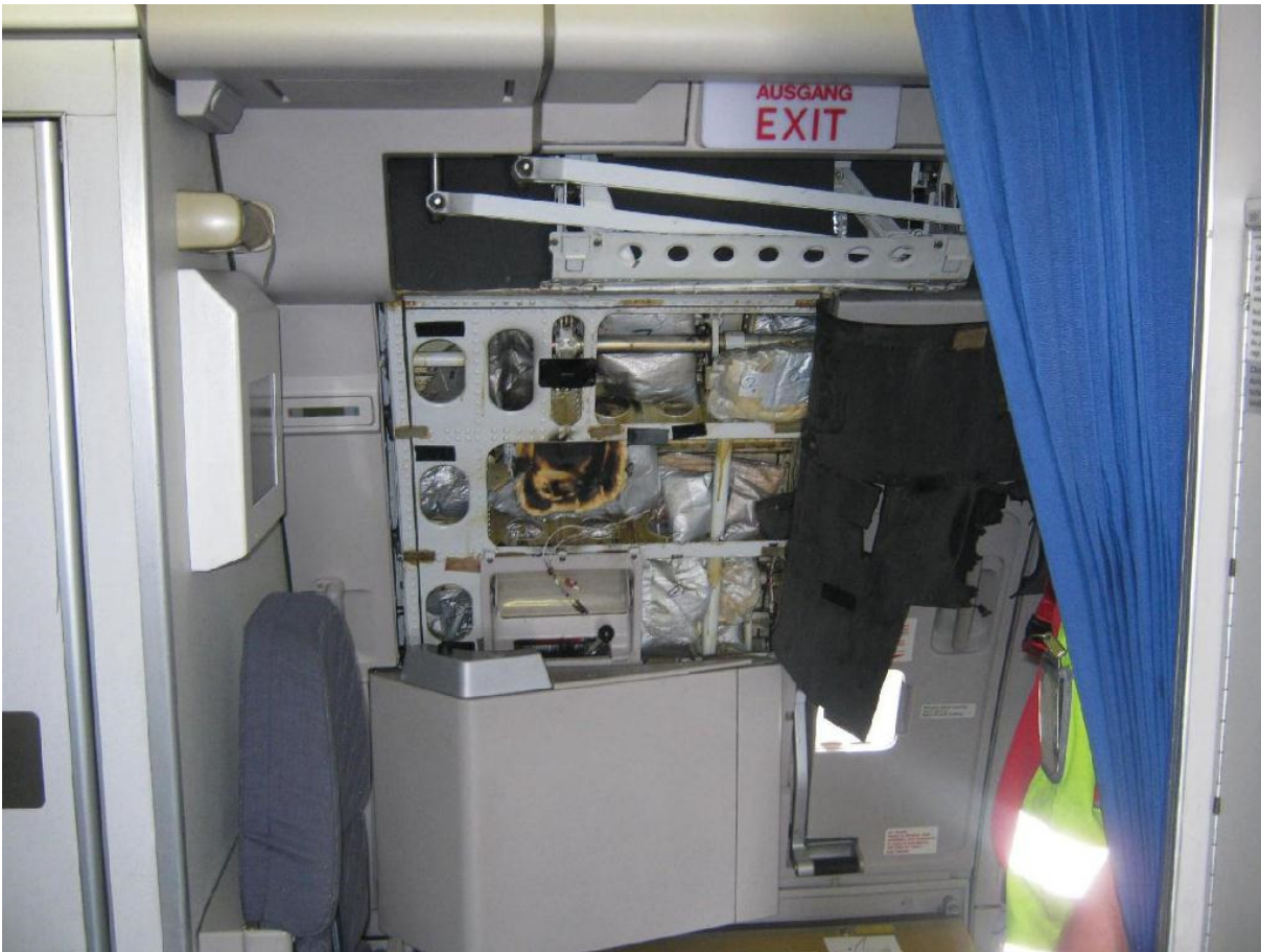
Fire area on door R2 after the panelling was removed