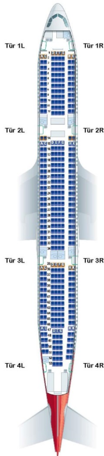
Cabin Layout Airbus A330