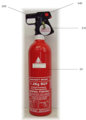
Fire extinguisher (example)